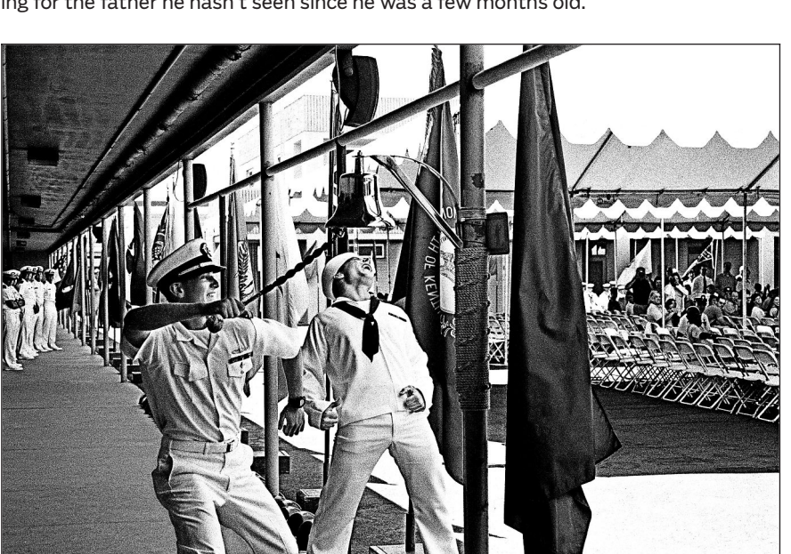
Unprecedented access allowed Freid-Perenchio to snap revelatory shots of the SEALs' lives. Many of the photographs were published in a 2009 book.